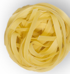
Fettuccine n. 91