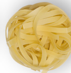
Tagliatelle n. 92